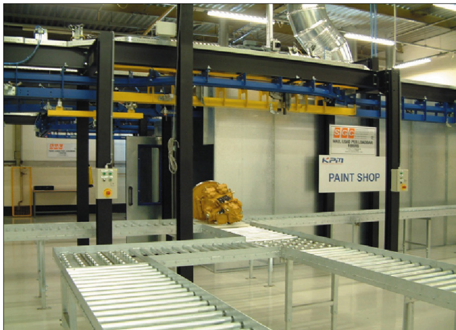
An overall view of the roller conveyor holding area and load station.