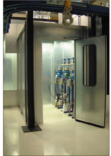
The dry filter two-station manual Eurospray 'Whisperbooth' low-noise spraybooth (left), which utilises Ransburg electrostatic application equipment from ITW Industrial Finishing, and the adjacent paint mixing room, which houses three airless pumps from Wwa.