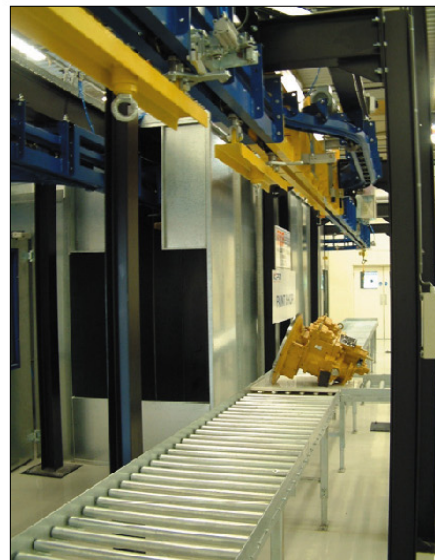
Pump bodies are loaded onto the paint plant's power-and-free overhead conveyor circuit, by means of a drop section, which allows them to be attached by the operator to the one-tonne capacity overhead flight bars without the need for manual handling. The conveyor was manufactured by Stewart Gill.

Added Mick: "Since we are located in a particularly environmentally sensitive area close to the river Tamar, it is vital and, indeed, it is corporate policy, that Kawasaki strives to minimise the environmental impact of its manufacturing operations."